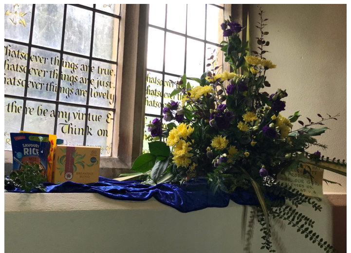
Harvest decorations at Timsbury and at Awbridge